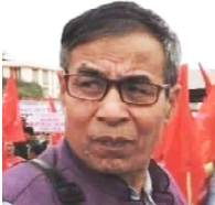
IT News Imphal, Feb 9: